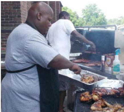
The Chicken Fest was fun and delicious!