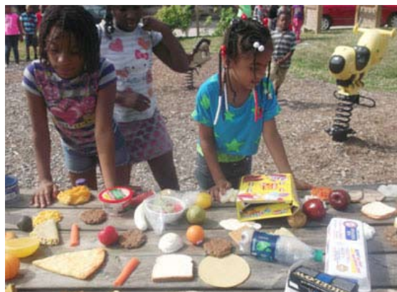
Healthy food and exercise are core components to all our activities during the Padua summer camps.