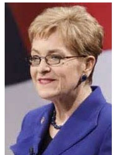
Representative Marcy Kaptur underwrote the attendance at the Growing Power conference.