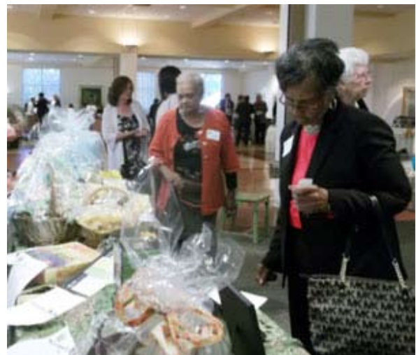
Guests view the many items available at the event.