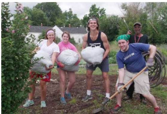
During the summer and again in the fall, YES groups from the Diocese of Toledo worked in the Ujima Park and Garden. Thanks, YES group!