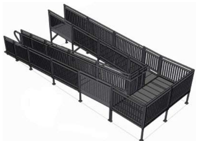
This is the type of ramp Padua Center plans to install.

Since Padua Center opened, staff wanted to make the building accessible to all. A generous grant from Toledo Rotary made this dream a reality. With the installation of the ramp Padua Center, first floor, will be accessible for wheelchairs and persons with walkers.