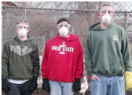
Boy Scouts ready to clean the chicken coop!