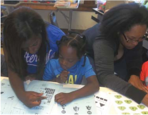
Keeping up on our Math Skills is important for our summer campers. They are ready to return to school in August.