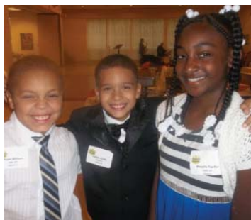
Three of our young people are enjoying helping at the Peaces of Art 2017 Celebration.