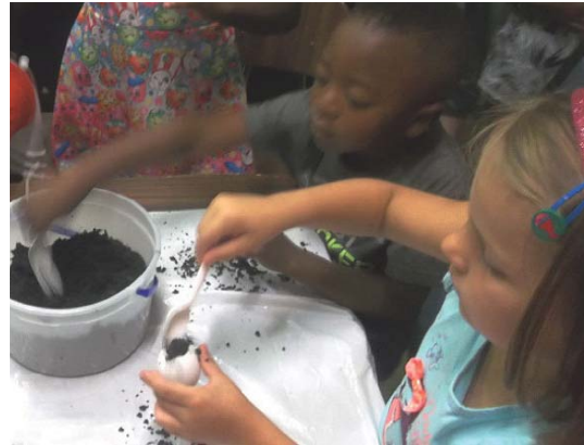
Learning to plant seeds in an egg shell! All part of the Potters group.