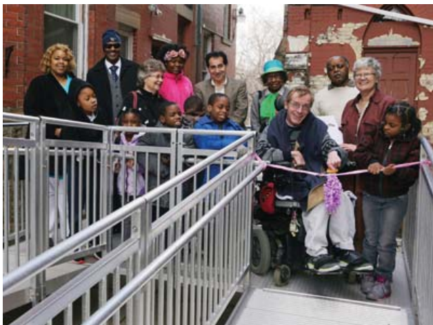
Ribbon cutting for new ramp made possible by the Rotary Club of Toledo.

Rotary Club of Toledo — accessibility ramp installed St. Francis Grant – Kwanzaa Park Neighbors meetings Toledo Community Foundation — Restoring Possibilities program extended State of Ohio and Medical Mutual – Community Connectors mentorship program developed