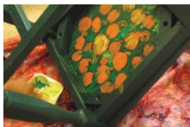
The painted Padua Chair.