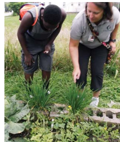
Working and learning in the garden.