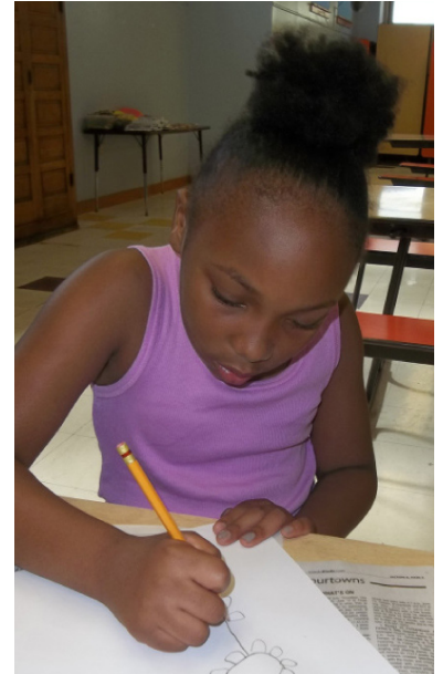
A budding artist preparing for Peaces of Art 2018.