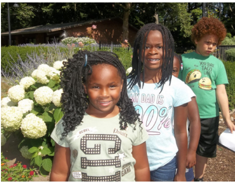
The visit to the Toledo Botanical Garden was a great experience for the campers.