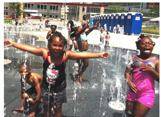
Of course, the splash pad was a real hit on a very hot summer day.