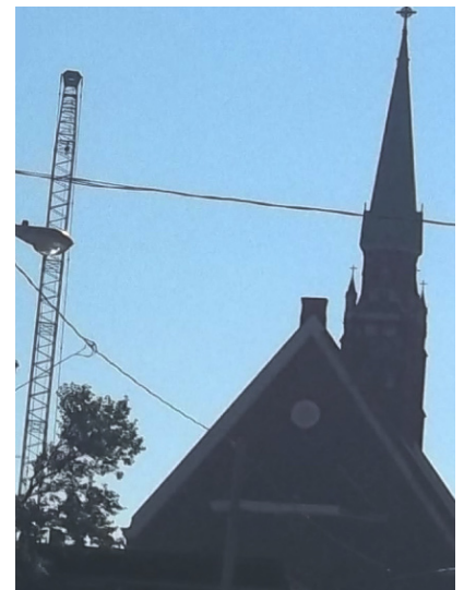
A large crane looms over St. Anthony Church. The crane and other equipment arrived on June 1, 2018.