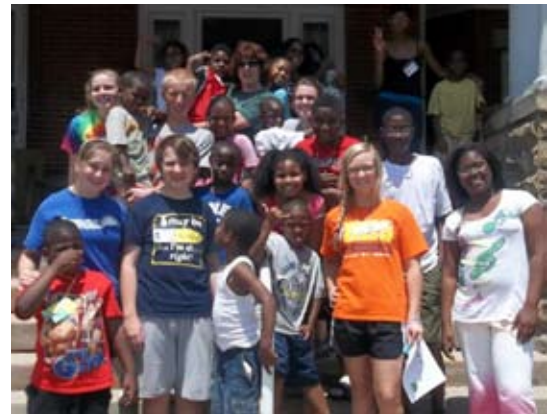
Smiles and great energy were evident during our Vacation Bible School. Here's the group gathered for a farewell picture.

Each summer children from Kwanzaa Park look forward to the free summer camps held at Padua Center. Each year we begin with what is most important to us, as a Catholic Christian-based Center, Vacation Bible School. This year our theme was, No Friend Like Jesus .