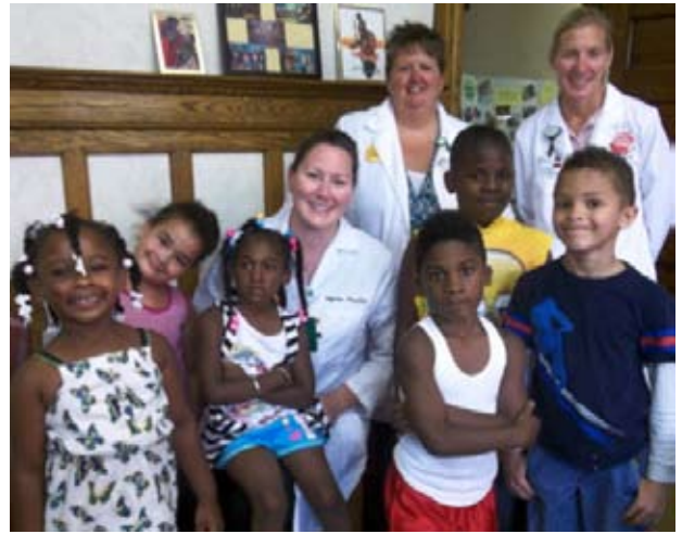
ProMedica staff provided health education for our campers during the Hurray for Health camp with blue light germ test for the children after they washed their hands.