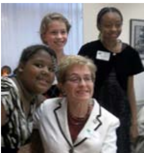
Rep. Marcy Kaptur with our Emerging Young Ladies at the 2011 Peaces of Art.