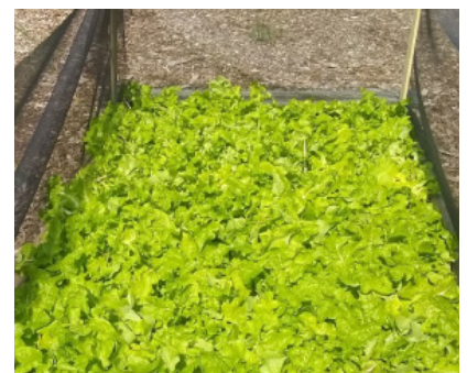
A bed of lettuce is ready for Market. Note the fencing to keep the groundhogs and rabbits out. They are our biggest challenge!