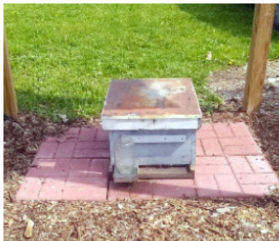
Have A Hive brought us a beehive and a guaranteed Beekeeper. The bees will pollinate our garden and are an educational resource for our students—especially for our Padua Potters.

Because of social distancing staff often seated children with siblings and a sibling group then socially distanced itself from other children. Students from the Corpus Christi University Parish spent a day volunteering at Padua Center, helping in the gardens and working with the children.