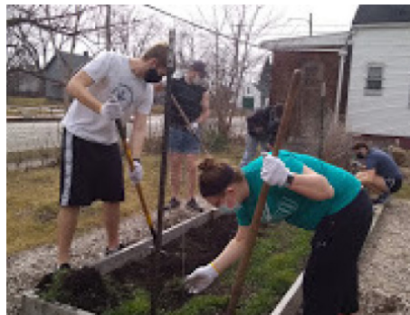
Corpus Christi University Parish volunteers spent some hours in the garden preparing it for the summer growth and fall harvest.