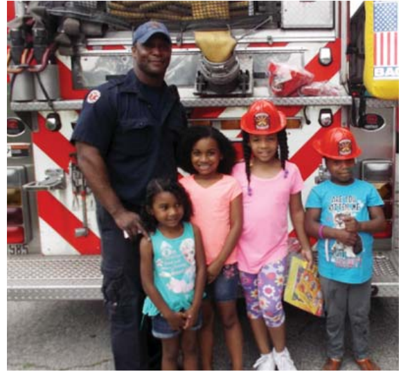
A visit from the Fire Department is always a hit at the Festival. The children enjoy seeing the Fire Truck and getting fire hats!