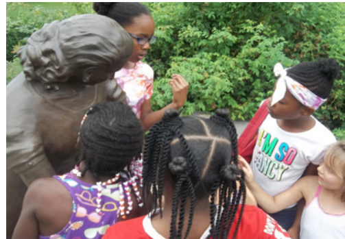
A trip to the Toledo Botanical Gardens was part of the Gardening Camp. This group of girls are discussing a sculpture.