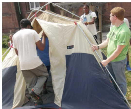
Youth Workers help Boy Scout members who instructed the boys in pitching a tent.