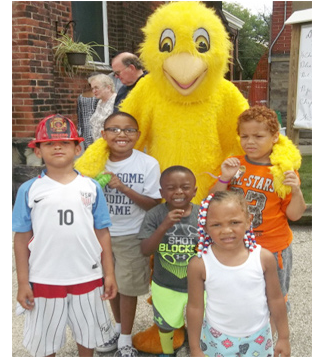
Some of the children pose with our guest chicken as they enjoy the free games and activities at the Chicken Fest.