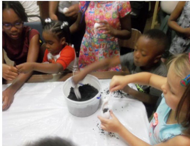
Children learned to make paper from recycled materials and planted flowers as part of the 2017 Summer Camps. More exciting activities this summer!